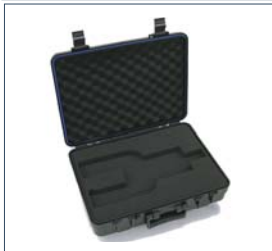
Optional Hard Case